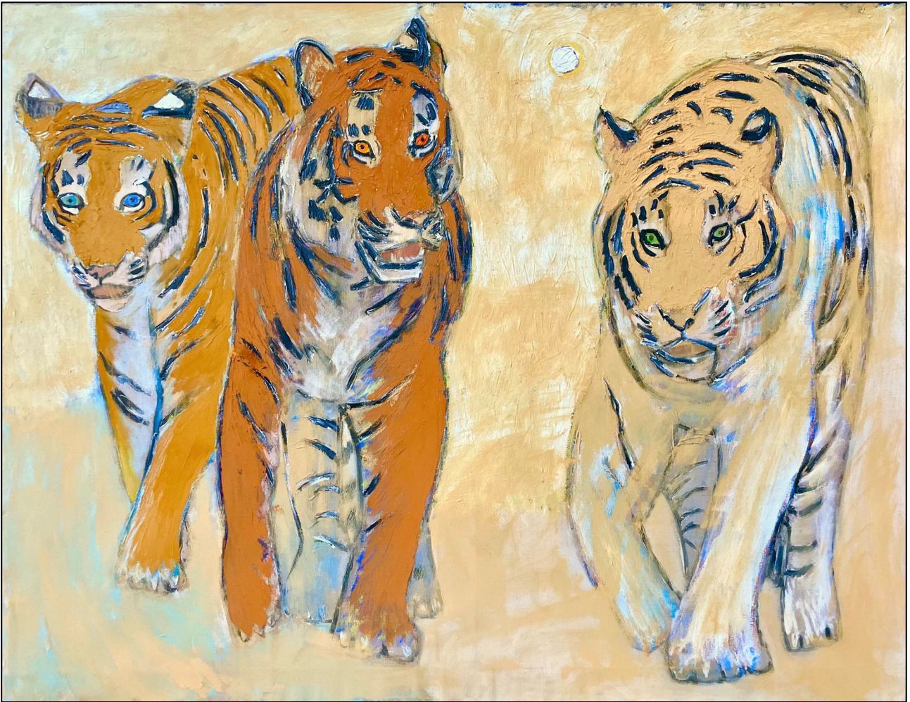
Light ochre - Three tigers. 100x130 cm. 2025.