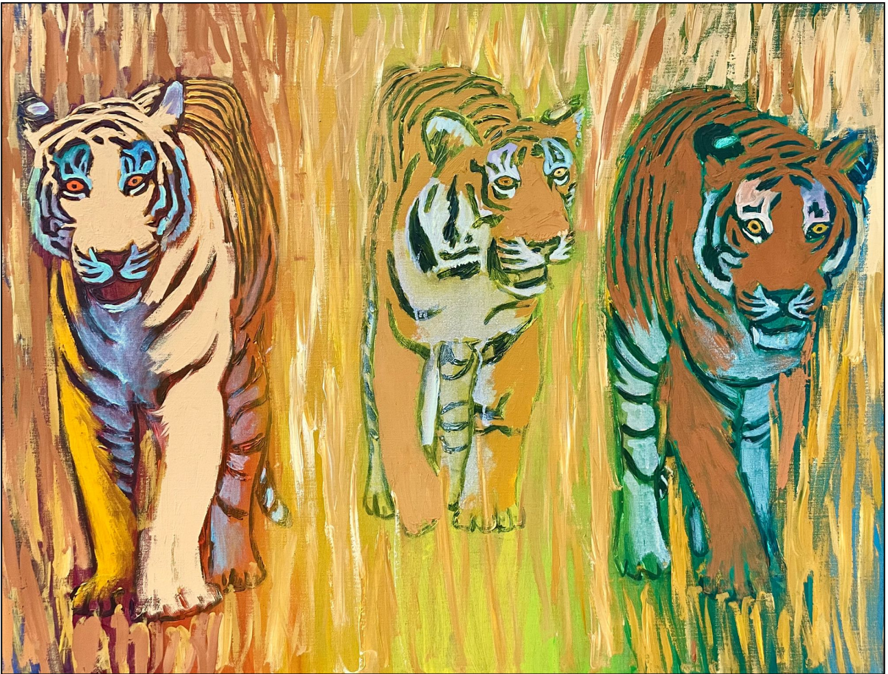
Ochre - Tiger in reeds. 90x116 cm. 2025.