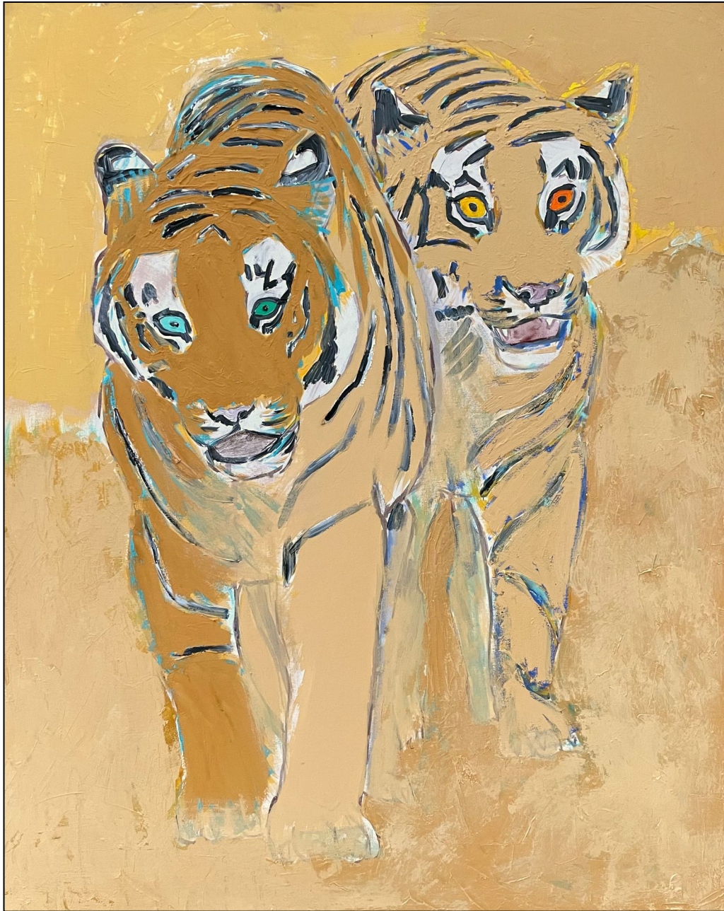
Light ochre. Two tigers. 100x80 cm. 2025.