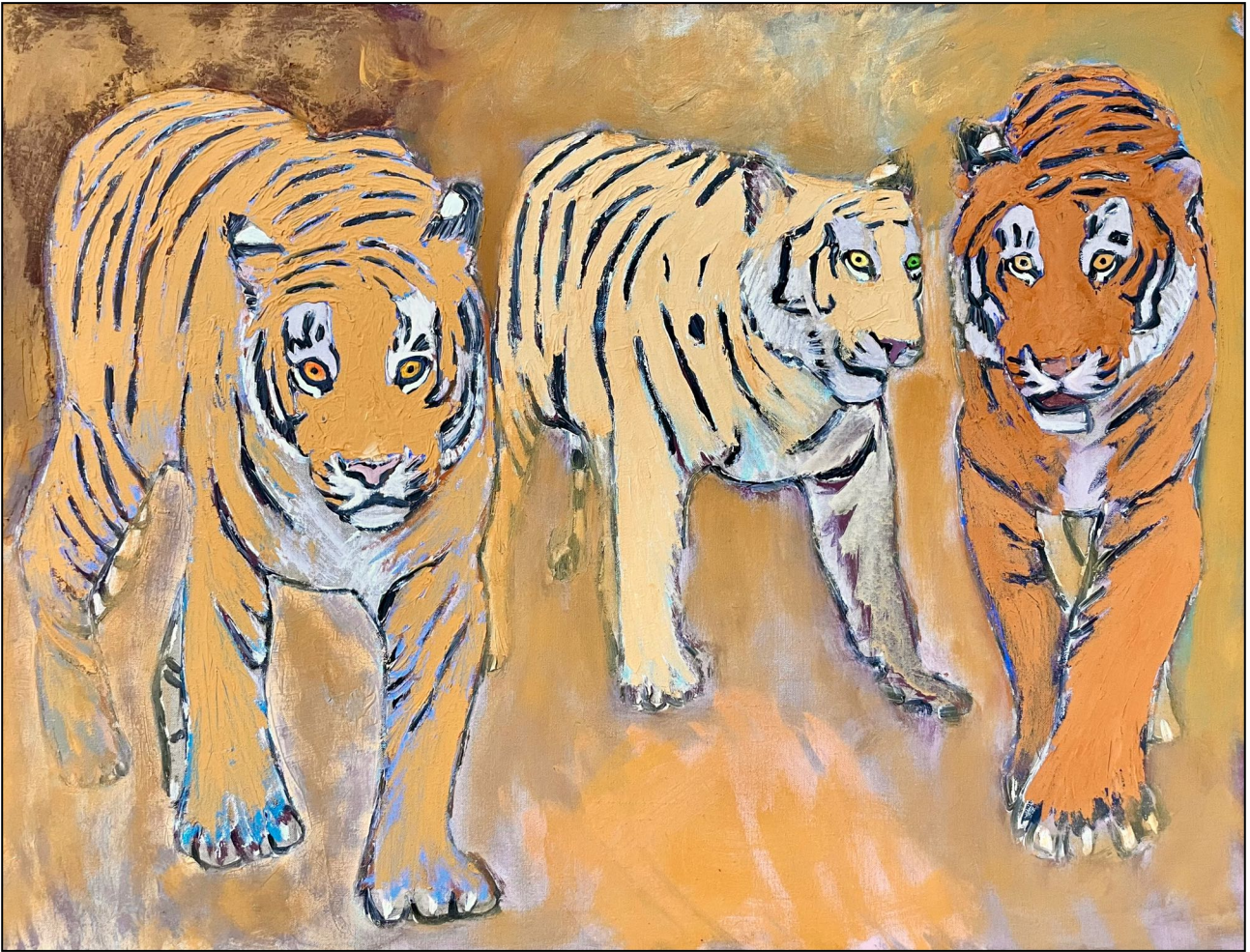
Ochre - Three tigers. 90x116 cm. 2025.